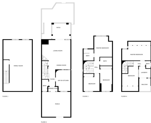
SIZES ARE APPROXIMATE, ACTUAL MAY VARY.